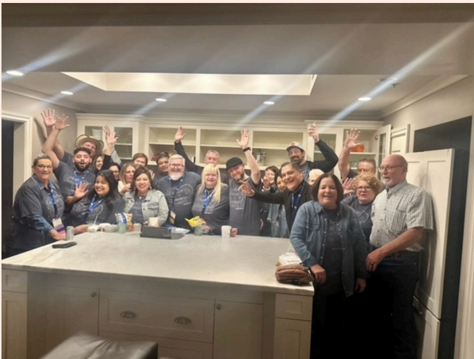
Social Hour in the Hospitality Room